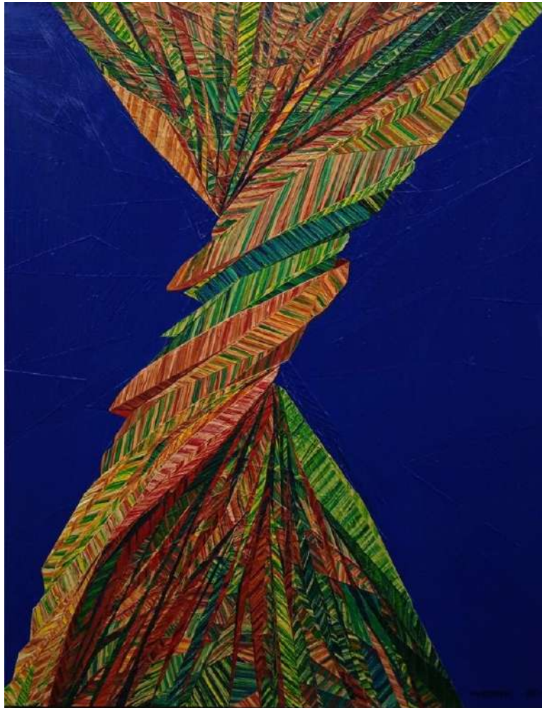
Crossing Acrylic on Canvas 70cm x 80cm, 2020