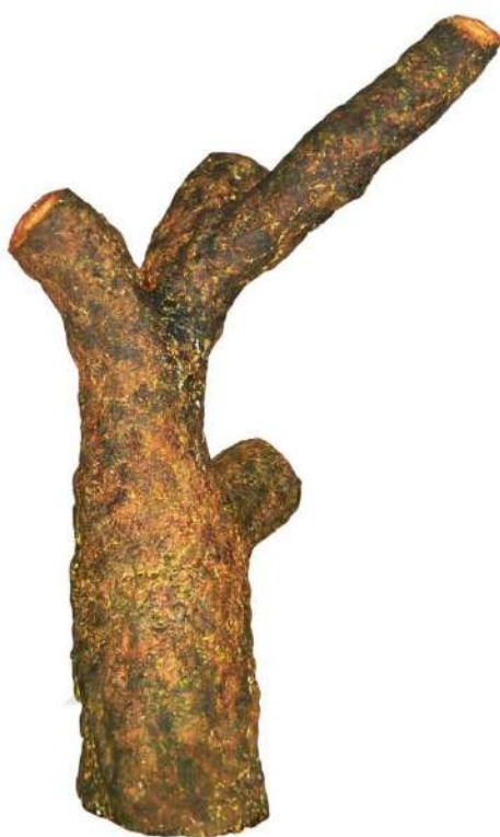
"Figure" Paper 140 x 70 x 60 cm, 2018