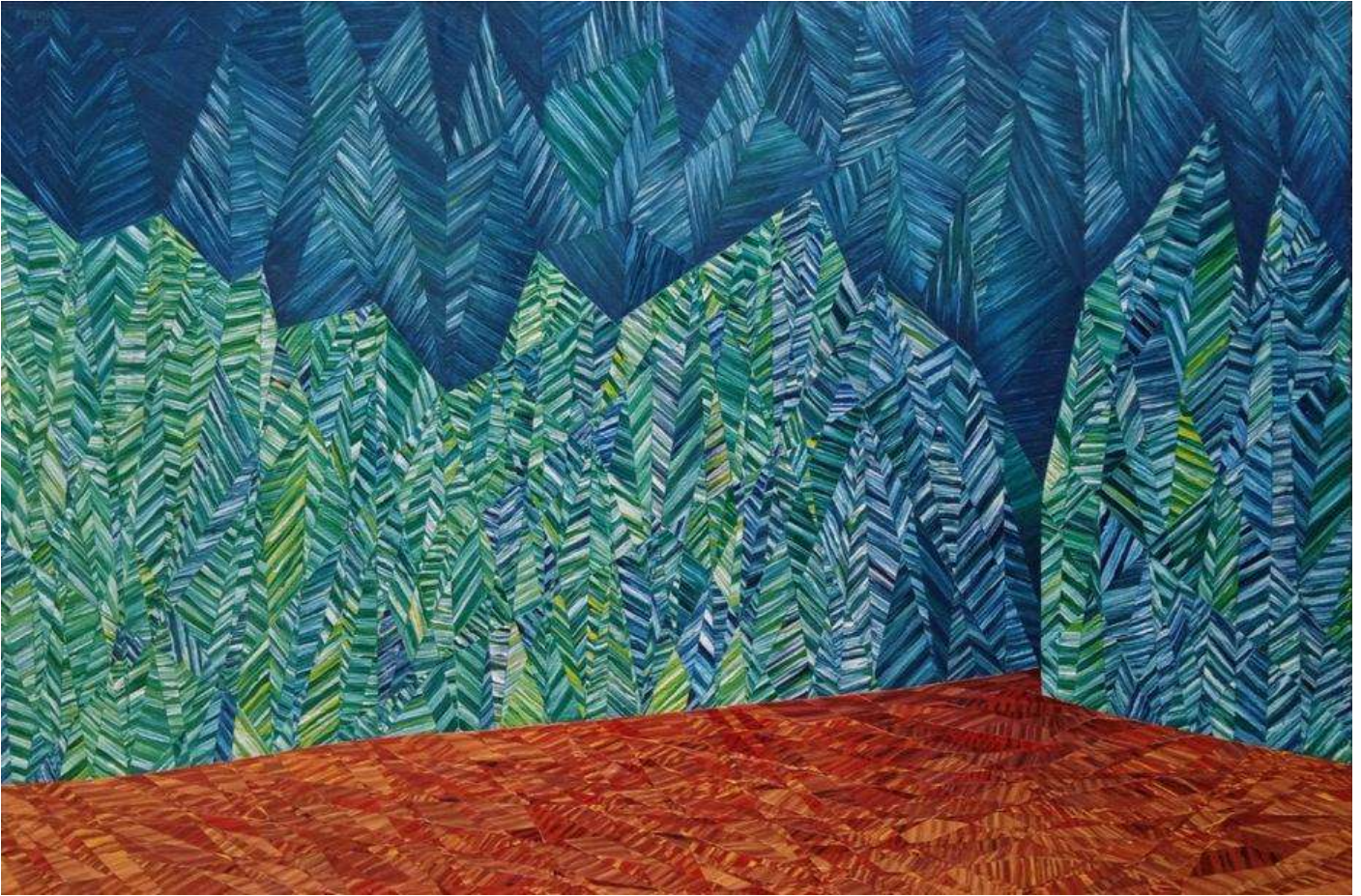
Silent Road Acrylic on Canvas 100cm x 150cm, 2020