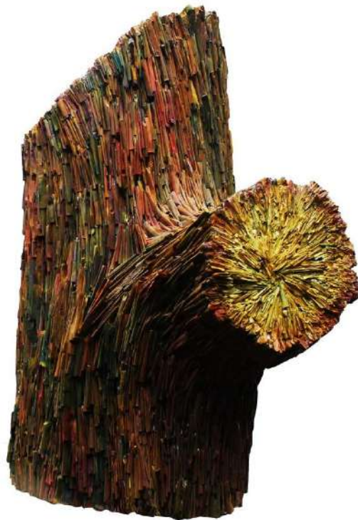
"Sepenggal Cerita (A piece of the story)"