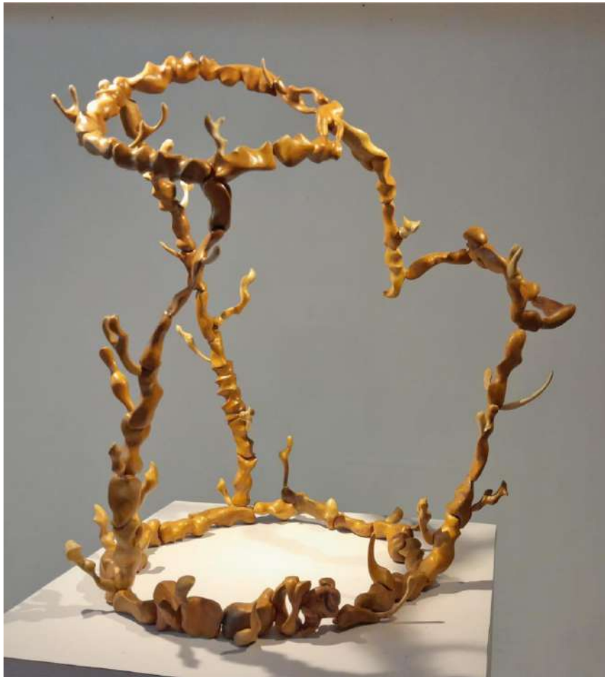
Sasana Alam Jackfruit Wood 40cm x 50cm x 60cm, 2025