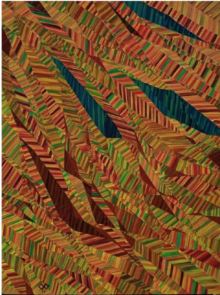
Bentang Alam #3 Acrylic on Canvas 60cm x 80cm, 2025