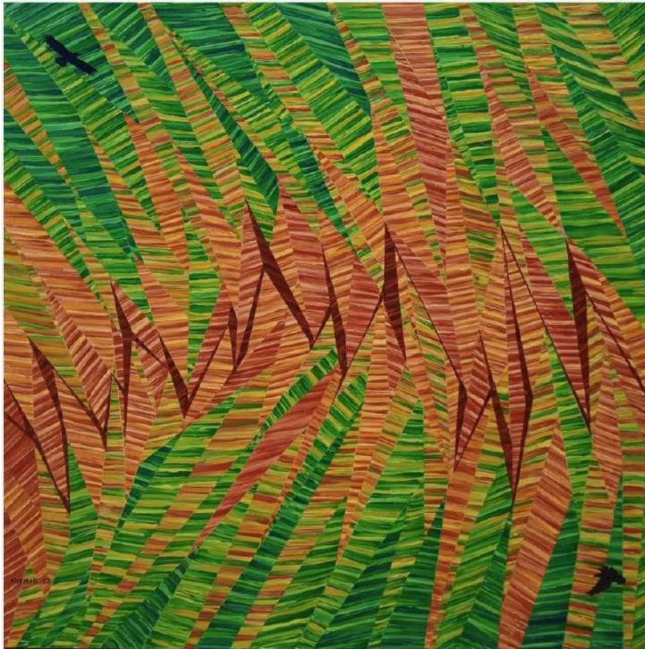
Explore Space Acrylic on Canvas 100cm x 100cm, 2022