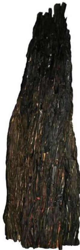
"Artefak" Paper 180 x 60 x 50 cm, 2018